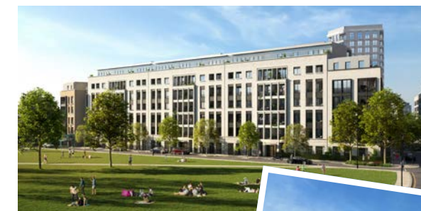
↑ The Auria, Notting Hill

The team at Peabody New Homes is dedicated to finding you a home that is more than just a place to live. A place to belong. A place that you're proud to call home.