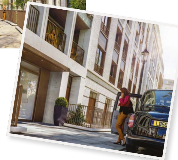
➤ ➔ View of Bond Mansions