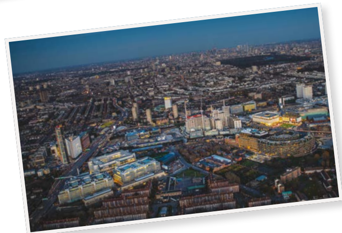
↑ View over White City showing Imperial College London, RCA and Westfield London

London is a destination of choice for learning and education.