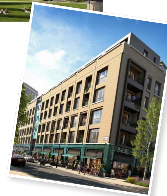
↑ The Auria, Notting Hill